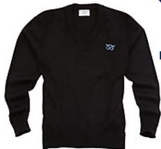
Black V-neck jumper with the Denbigh crest