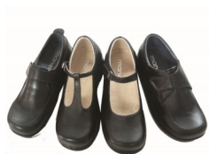
Sensible plain formal black shoes