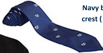
Navy blue tie with the Denbigh crest ( white knots to show you are in year 7)