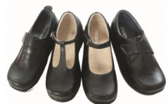
Sensible plain formal black shoes