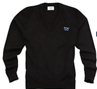
Black V-neck jumper with the Denbigh crest