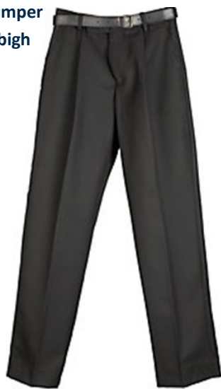
Smart black trousers