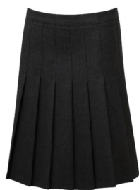
Optional smart black pleated skirt