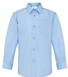
Light blue school shirt

As a student at Denbigh School, you are expected to wear our school uniform with pride wherever you are. You should make sure that you are smart every day. You will receive more details about our uniform requirements.