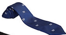
Navy blue tie with the Denbigh crest (orange knots to show you are in year 7)