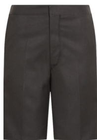
Summer term optional smart black shorts